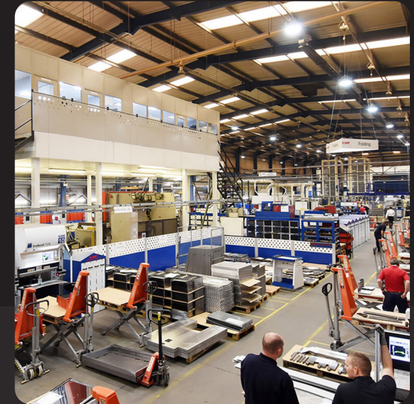
LED lighting solutions